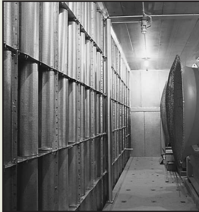
A bank of SOUNPAK rectangular silencers reduces fan noise in an HVAC plenum.

McGill AirSilence also designs and manufactures SOUNPAK silencers for specialized applications where rigid design and noise reduction criteria, unique space limitations, adverse environments, or other special conditions preclude the use of standard models. Contact McGill AirSilence for assistance.