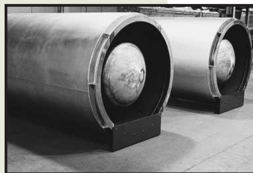
These custom, heavy-duty duct silencers are designed to withstand high temperatures while reducing noise at the discharge of a gas turbine.